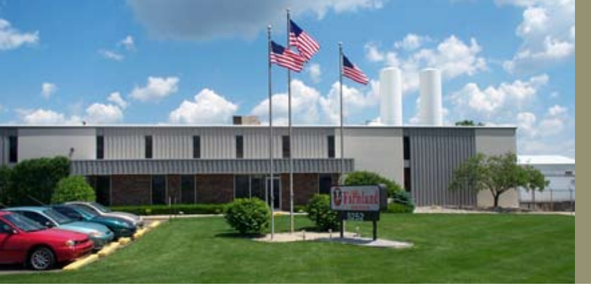
The Grand Rapids dairy plant in Michigan is part of Agropur's investments in 2009.